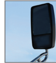
Breakaway Convex Mirrors