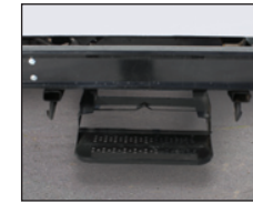
Rear Step & Tow Hooks