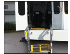
Rear Wheel Chair Lift