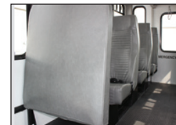
Barrier & FMVSS222 Seats