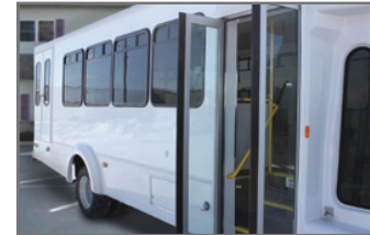
High Gloss Exterior Fiberglass