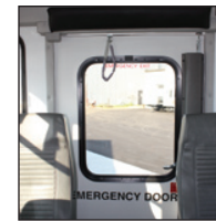
Emergency Door with Child Check System