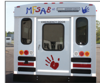
Emergency Rear Door