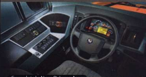
Completely New Drivers Area