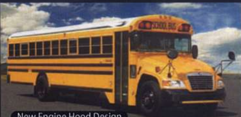
New Engine Hood Design